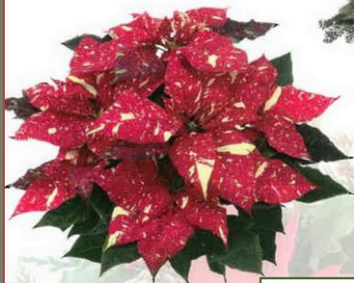
Poinsettia Red Glitter